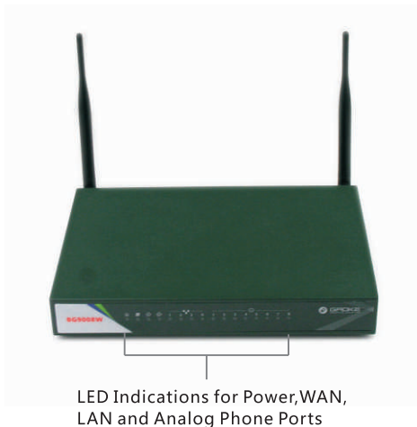
LED Indications for Power, WAN, LAN and Analog Phone Ports